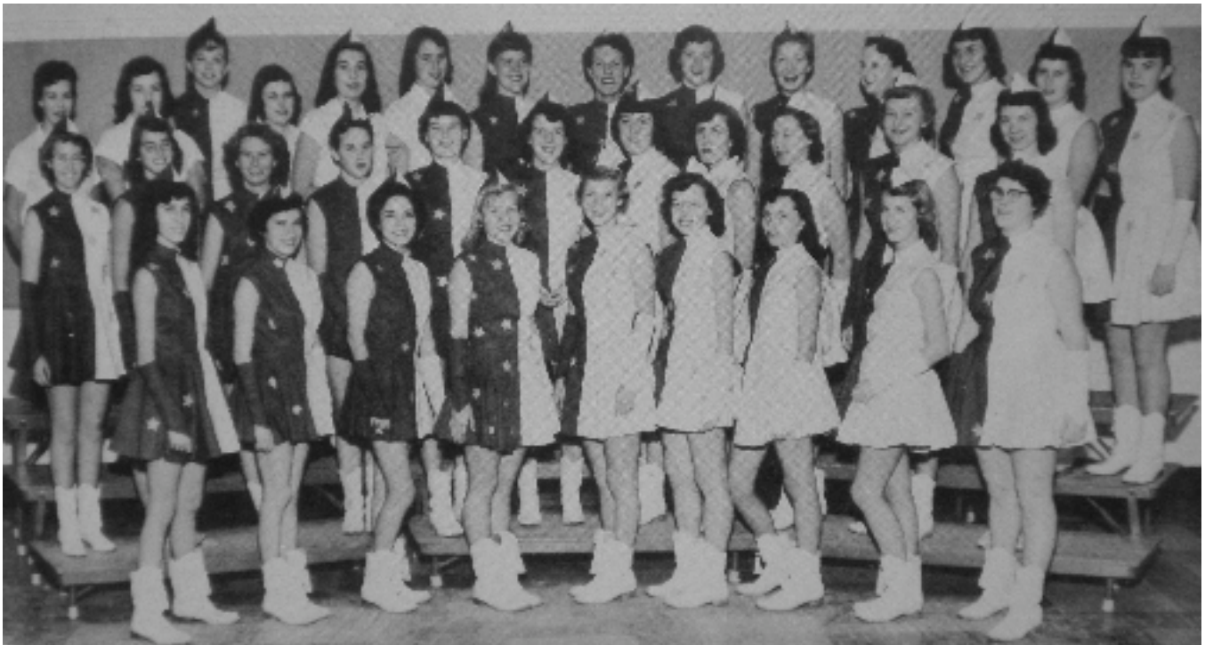
Girls' Drill Team (1954)